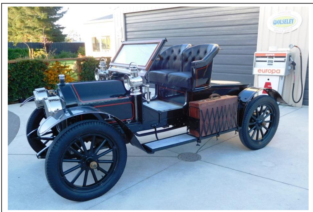
1909 Wolseley Siddeley – latest addition to the Hey family collection

it a full service, including removing the sump to clean it out, stripping the carburettor because it was all gummed up and flooding badly, and generally just checking everything else. Like our 12-16, it's very simple and pretty robust mechanically, however it is old and fragile, and things need to be treated carefully to avoid breaking or damaging anything,