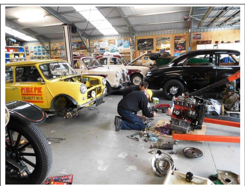
Easter Monday and the Pork Pie Charity Run Mini in bits

to remove the clutch and flywheel assembly, despite having a good puller and plenty of heat and hammers available. In the end, we gave up, and Glen decided to go to plan B, which was to clean up the original thrust washers and housing as best he could. By then I had also found a brand new first motion shaft bearing and gaskets in my own spares stocks (it was Easter Monday, after all, so we