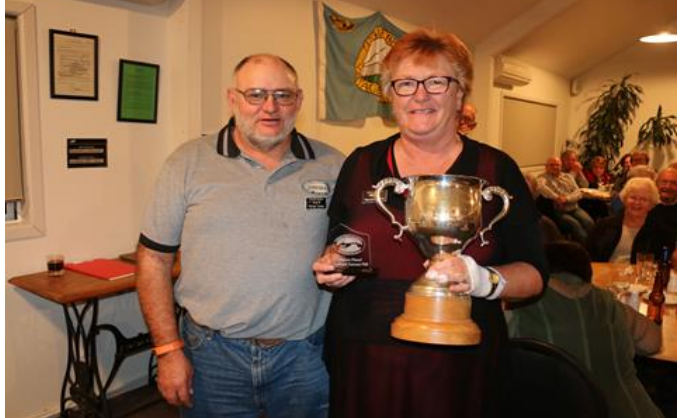
Off Rallying, guess who is driving?