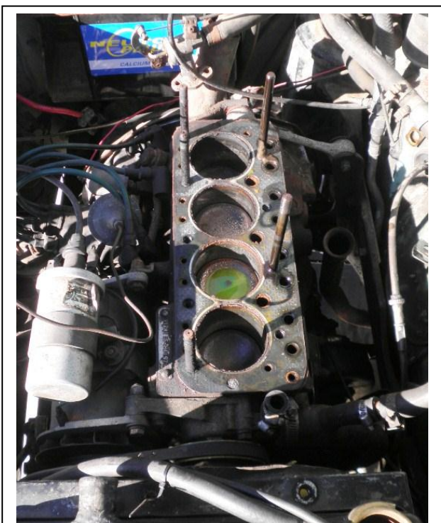
The club's 1300 with the head off – water can be seen sitting on no.2 piston.

into more of a problem, but I hadn't checked to see if it was just a tuning problem or something a bit more serious. Anyway, it's good that it's happened now – that way we can