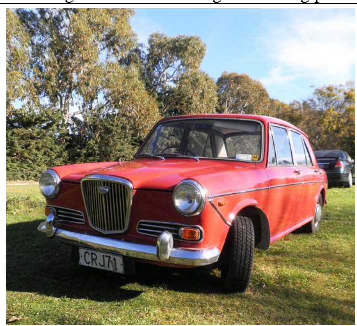
Simon Verkerk's newly purchased 1300

work lately will testify, the current fee for a pump-up job is around $80, and even then they are reluctant to do it, so it we can assist members to do it for just the cost of the fluid (which we can still readily purchase) then it's got to be good. Meanwhile others carried on with the good work of sorting and storing parts.