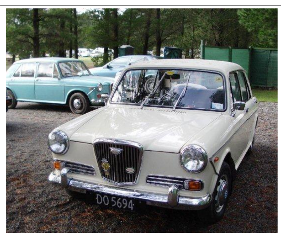
Ray's car (front) and the club's car after a hydrolastic re-set.

four cars altogether -Wayne Stansbury's 18/85, Ray and Wendy Willoughby's 1300, the car that Simon now owns, and then for good measure, we also pumped up the club's 1300 to the correct height as well. It was a most successful operation, with all cars now looking level and trim, and along the way we found the possible source of a leak on Simon's car – only requiring a joint tightening up to hopefully effect cure (seems to have worked just fine). As anyone who has tried to find someone to do this