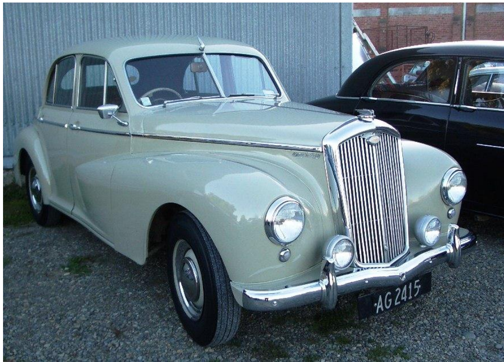
Eddie & Nancy Bishop's 6/80 at the book launch – it is also featured in the book.

launch. At $139.00, it isn't cheap, but it is crammed full of material of interest to anyone with a car from the Nuffield and BMC lineage. It even has one page with a photo of our