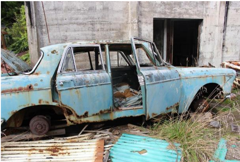
Derelict Wolseleys in a yard in Shannon