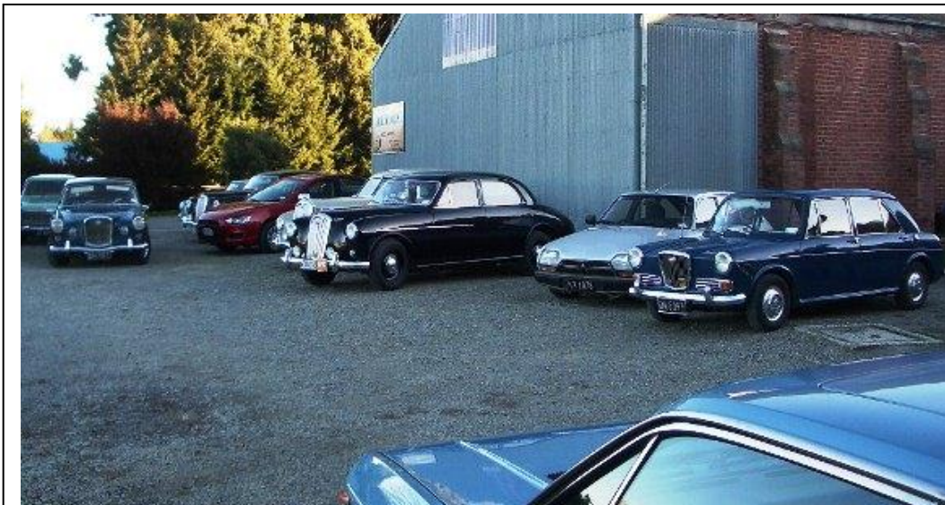
Display outside Bains Motor House for the book launch

Morris centennial year. Bains Motor House (a recently established classic car sales business which we visited about 2 months ago) was the ideal place to launch the book, and signed copies of it were available for sale at the