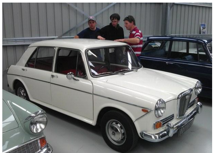
A recent addition to the collection is this Wolseley 1300

Colin's collection is indeed a good one. All of his cars could be described as every-day type classics, and they are all in showroom condition and displayed with sales material and a bit of history about the model, and the particular car's own history as well. They are all in running order, and Colin does use them all from time to time, just to ensure they are kept up to scratch and can be used for some event if needed. Amongst his