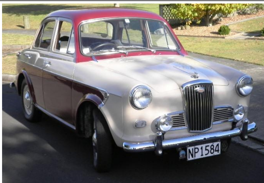
Our Mk1 1500

If you cast your mind back 3 or 4 newsletters, you may remember that I had mentioned that I thought I may have had a problem with the Mk1 1500. I had taken it for a WoF, and when I went to collect it there was a puddle of oil at the front of the engine that looked as though it may have come from the timing cover seal. I was worried that there may have been a deeper problem than just the front seal. I basically just took it home and put it in the shed for later. Last weekend it was the local