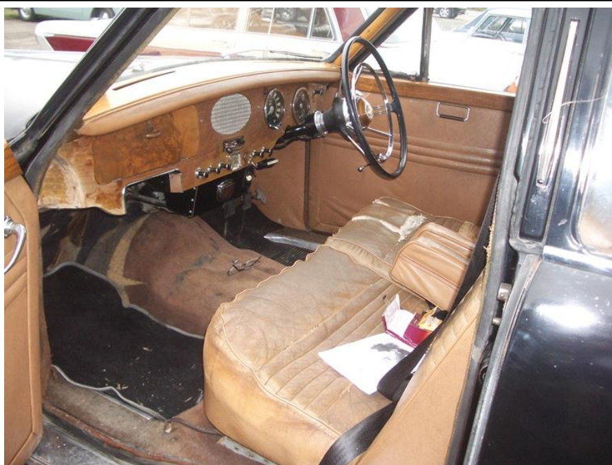
Restore or just maintain. This is the interior of Ian Sprosen's very original 6/90 – worn but intact and factory made. What to do???

some barn-finds should be returned to the road with the absolute minimum of restoration work, so that the full reference to originality and period materials isn't lost forever. I know that in my own experience, I wish now that I had not embarked on a full restoration of our 25HP, as it was a very good original car before I started, and could have been repaired mechanically and kept that way. There would have been plenty of room for cosmetic improvements over the years, but at least the original build and materials (particularly inside the car) wouldn't have been lost, and I could have been enjoying it on the road all these years, rather than it taking up the space of two cars in the shed in a semi-restored state. We live and learn! Have a good month. Colin