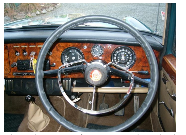
Photo shows one of Roger's steering wheel covers fitted to Gordon Duthie's 6/110.

Quality reproduction hand-made 1940 to 60's style vinyl covers with foam backing for driver comfort, made to measure with a choice of colours. Includes stitching cord, a bodkin and fitting instructions. The diameter of your steering wheel and its rim required. Good value at $63 each. Phone Roger Honey on 06 8684846 or 0274780872. email rohoney@clear.net.nz (Club Member)