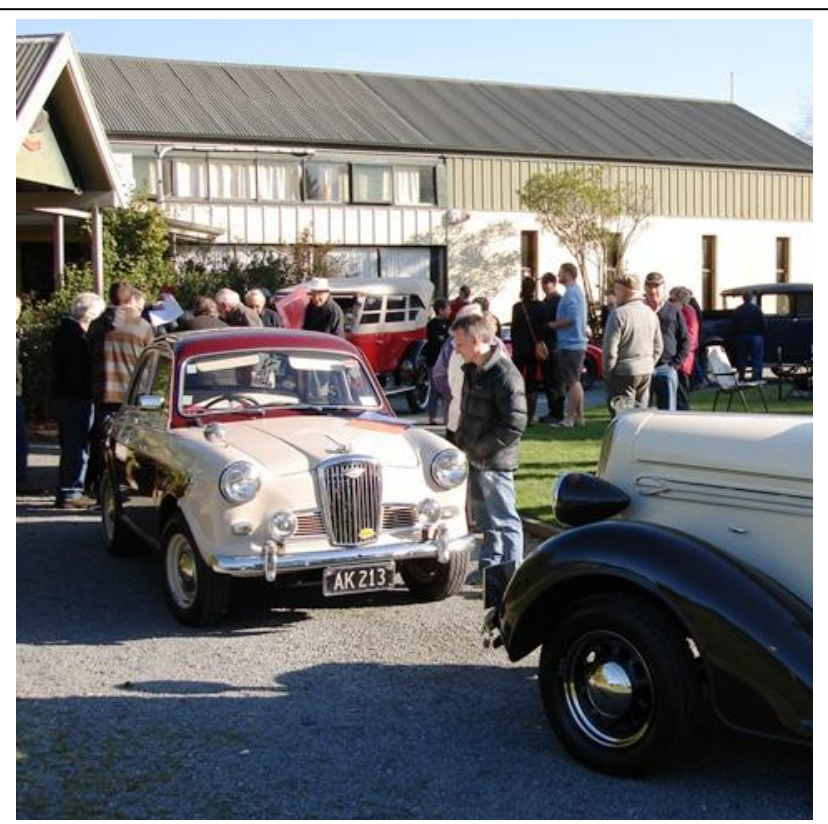
Judging underway at the VCC Restoration of the Year run.

difference to the way it runs and idles – so much so that I might fit one to our Mk1 1500. Anyway, the judges were let loose on it, and they certainly were not slow in pointing out the faults we knew about, like some uneven panel gaps, widened rims, a small dent in the