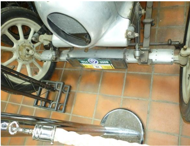
Front end of the Wolseley Moth replica

parachutes. It must have had a lot of use as the seat(leather) was well-worn. A replica Wolseley Moth early racing car was displayed. it was built around one of the original motors, a 10Hp overhead cam of about 1921. The Moth, being very successful, was still taking podiums for many years. Many cars that had raced at Brooklands were on display - too many to describe. Some of the Racing Lockups (garages) were painted with the signwriting of the pre-war era. The clubhouse is still much the same as it was when it was built in 1907. This was for the