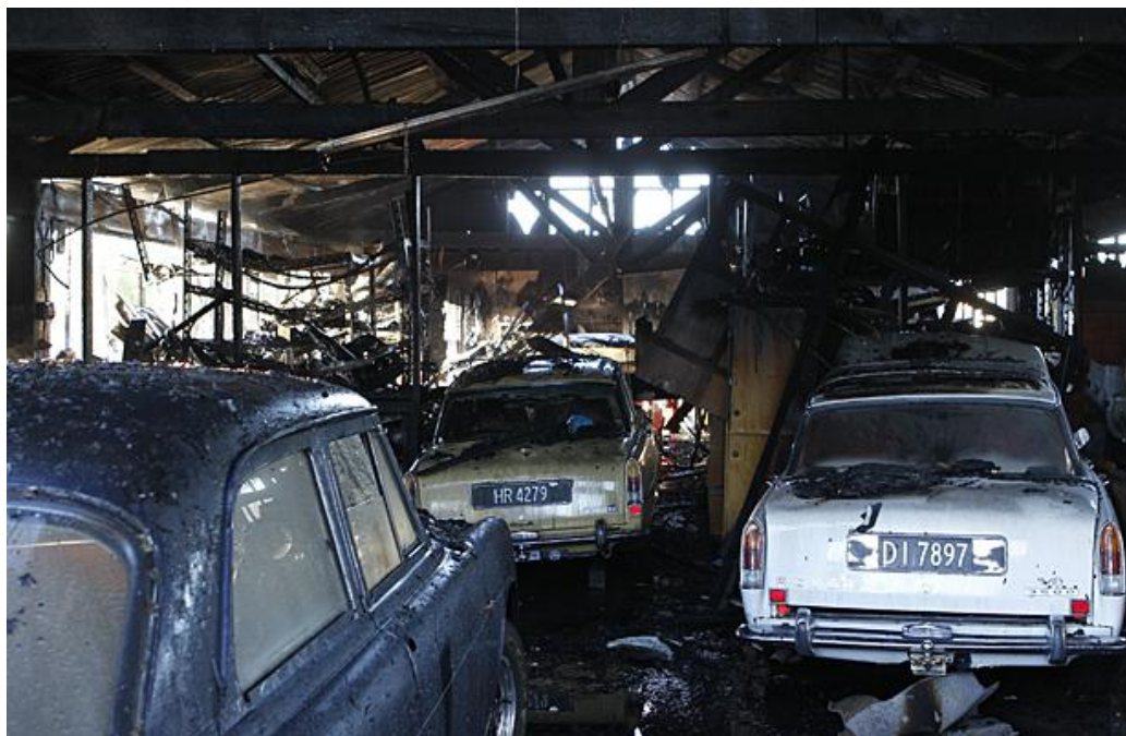
Aftermath of the fire in a Rover enthusiast's shed

now that they are all out and inspected it fortunately appears as though only one of them is beyond repair. Many of his cars were in concours condition or in excellent original condition. Most have paint damage, and some have damage like melted lenses and trim, and he reckons it's going to be a long time before he has them back the way they were. One of his biggest losses is years and years of collected and purchased spares parts – a lot of it new-old-stock, which simply cannot be replaced. He also had to find space to put all the cars while he has the shed re-built, which won't be a quick job by the time he gets consents, permits, and then actually finds a builder to do it (they are a bit scarce in Christchurch just now). All in all, a sad story, but he said the very best thing that has come out of it is the offers he's had of help from Rover Car Club members, neighbours, and car enthusiasts from all around Christchurch. He said he felt like giving it all away straight after the fire, but he reckons it's these people that quickly put an end to those thoughts, and now he just wants to get on and get everything fixed up and carry on. This is exactly what we found after the earthquakes. We certainly need good friends, fellow enthusiasts, and good neighbours, and we're all the richer for it.