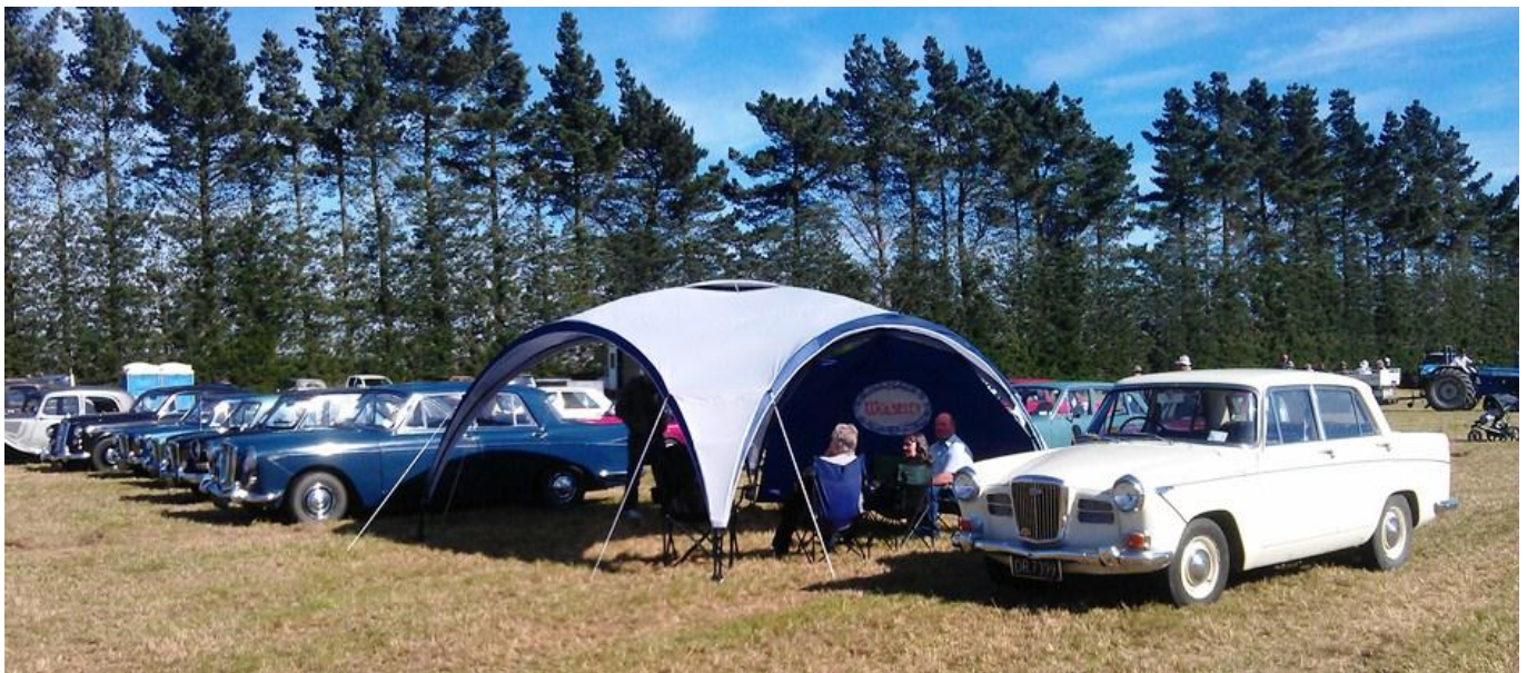
Our cars at the Wheat and Wheels Rally, near Ashburton. Out of shot is Peter Gallagher's 6/110

I was particularly impressed by the display of trucks (probably around 100 of all types and sizes on display), and by the huge number of tractors from the very oldest to the newest, smallest to largest, on display and even working out in the improvised show ring. It was an excellent event – particularly well organised and held on a perfect early-Autumn day. I was glad we made the effort to go.