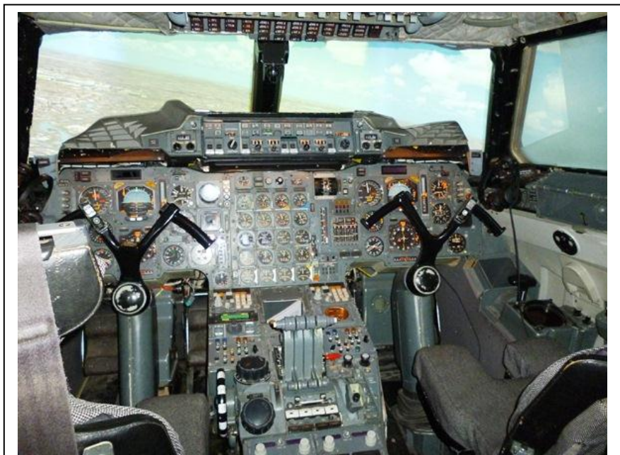
The flight deck of Concorde

This morning one of our group had suspected pneumonia and was staying in Dorking until well enough to travel back home to New Zealand. We all felt sorry for him, as there was still so much to enjoy coming up. It was a short drive from our accommodation to the Brooklands Museum. This was one of the highlights of our trip. Most of our group thought this was going to be an event that they did not want to miss, and now, having seen Brooklands, I now