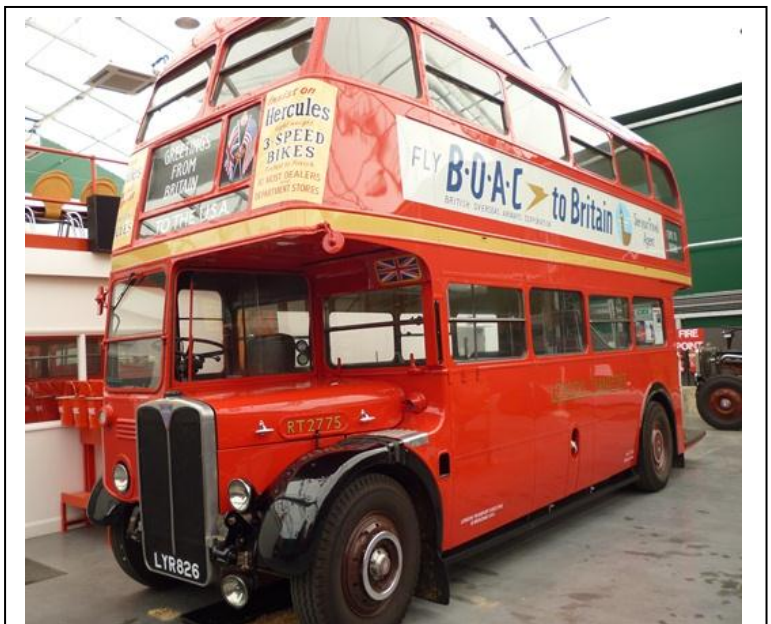
In the London Bus Museum

After Brooklands 'proper' we set of for a visit to the London Bus Museum. It included life-like horse-drawn buses of about 1890. A display of mostly double-deckers from the early days (when there were no front brakes) up to 1972. Guy, AEC, Leyland and Dennis buses were represented, and also an 'O' Bedford articulated bus, and a few buses that had been converted to breakdown wagons. Then we moved onto the displays of cars. One of the first seen was a 1930's Napier-Railton - a huge car. On inspection, it had large disc rear brakes. On enquiring, it had been converted to discs some time later in its life when it was the fastest car that was capable of being able to test