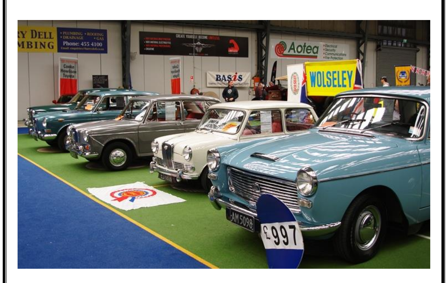
Southern Region Branch display at the recent 2015 Dunedin Autospectacular