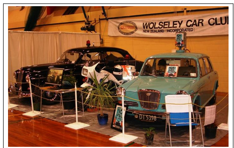
Our "Best Club Display" at the Christchurch Classic Car Show

Planning was also started for our proposed display at the Classic Car Show on 26<sup>th</sup> and 27<sup>th</sup> September – all the stuff that had been put away after the last show (which was before we shifted to Idlewood) had to be found, and it was. The theme for the show was "Top of the Line", so the original proposal was to use Joe Barkers 6/110 Mk2, and possibly my