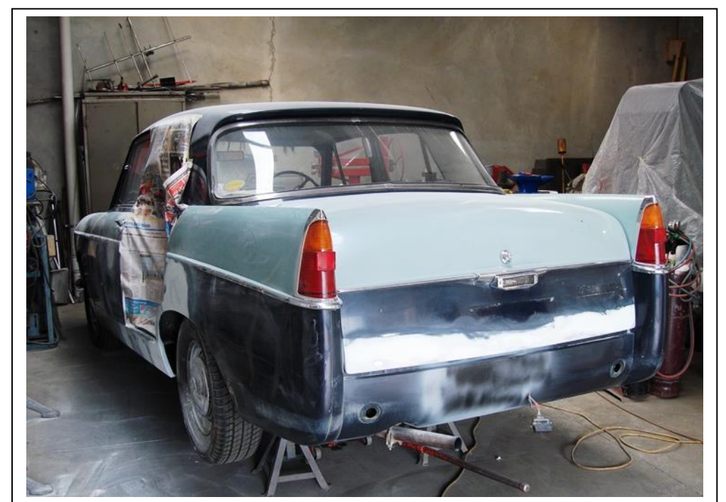
The 6/99 mid-way through some bodywork refurbishment

As far as our own cars are concerned, progress has been good this month. The 6/99 bodywork repairs are now finished and we have it back home and looking great. It needs a good cut and polish to finish it off (only the lower LH side and back of the car were