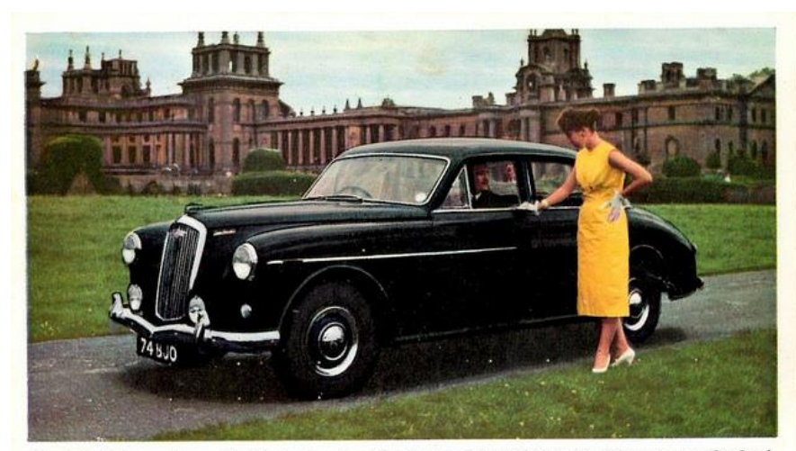
Blenheim Palace makes a dignified setting for this picture of the Wolseley Six-Ninety, a car of refined character for the man of discriminating taste.