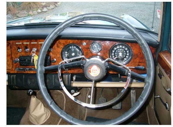
Photo shows one of Roger's steering wheel covers fitted to Gordon Duthie's 6/110.

Quality reproduction hand-made 1940 to 60's style vinyl covers with foam backing for driver comfort, made to measure with a choice of colours. Includes stitching cord, a bodkin and fitting instructions. The diameter of your steering wheel and its rim required. Good value at $63 each. Phone Roger Honey on 06 8684846 or 0274780872. email rohoney@clear.net.nz (Club Member)