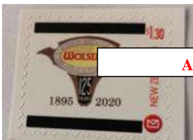
And finally, genuine NZ Postage stamps that can be used as-is to ALL SOLD ed. Again, these are limited, and available for $3 each. Note: every newsletter next month will be posted using one of these stamps.

And not quite last, but by no means least, a brand new addition to stock – a special pin badge (for jackets, caps etc) commemorating 125 years of our marque. The first shipment of these has run out – more in transit. Make sure you get your order in quickly. These are priced at $10 each