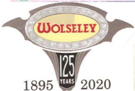
Windscreen sticker – special design to celebrate 125 years of Wolseley. Limited numbers $5.00 each