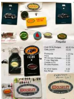
A variety of other items, including grille badges, lapel badges, key rings, coasters and fridge magnets.