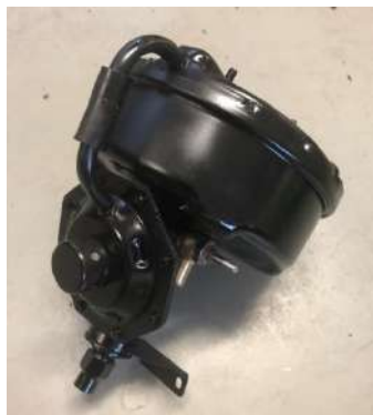
6/110 Mk2 booster reconditioned

enough, they looked like kits to overhaul the hydraulic components in Lockheed boosters. I decided to take one of them in to the business we take our brake parts to for reconditioning, and when I handed it over with the booster the owner couldn't get his hands on it fast enough! When I said we had about half a dozen of them he immediately asked if he could take them all off our hands as some of the seals are getting hard to find