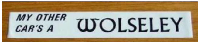
Rear window stickers as shown on left – “My Other Car’s a Wolseley, and “I Bought Wisely – Wolseley” These are $5.00 each